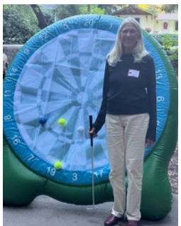
Gala Ticket winner