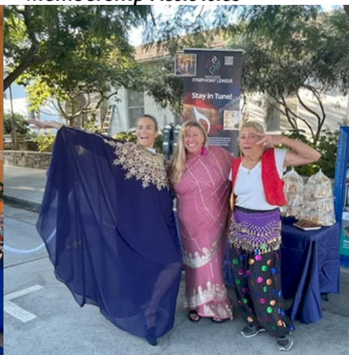
Having Fun at Sheherazade