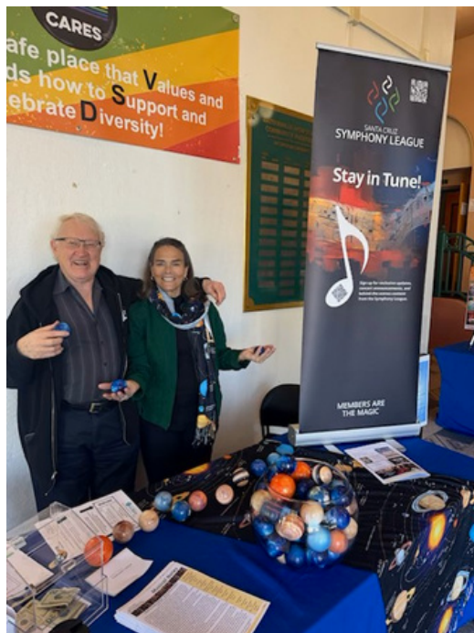
Enjoying The Planets with World-Famous Astronomer Garth Illingsworth