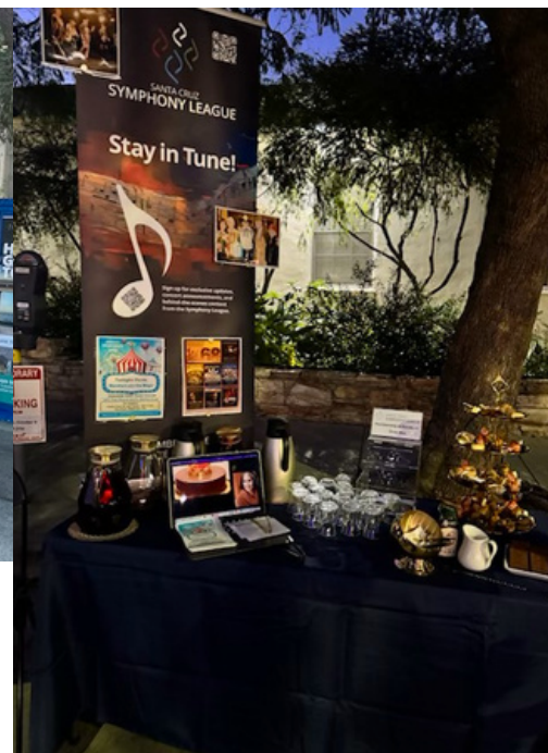
Sharing Tea at Sheherazade